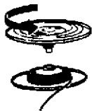
Removing Thread from Bobbin

If there is a lot of thread left and you do not wish to reserve it by setting aside the bobbin for future use, remove the bobbin, unscrew the two halves, and remove all the thread at once.