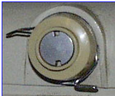
T&S – Some Stylist 500 Series